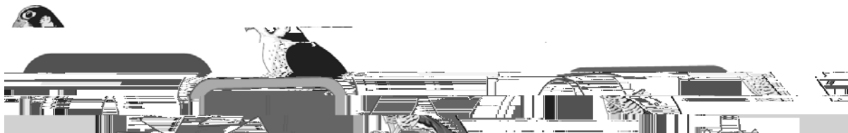
Figure 1. Examples of Logos

Facilitator says: “What are some examples of logos?” [Allow students to discuss. Facilitator should show or handout Figure 1 to help students brainstorm. Possible responses include the Nike swoosh, the McDonald’s Golden Arches, and the Apple from the company Apple.]